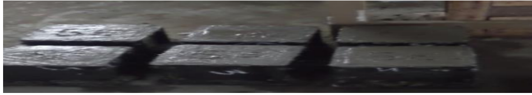
Fig. 3 Cubes Of Concrete With Replaced Cement By Fly Ash & Metakaolin