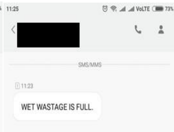
Fig 4: GSM message when the wet bin is full

As shown in the fig.3 and fig.4 we can observe the GSM messages that if the garbage bin is full, automatically a message through GSM is sent to the dust collecting person to his number that DRY WASTAGE IS FULL and WET WASTAGE IS FULL.