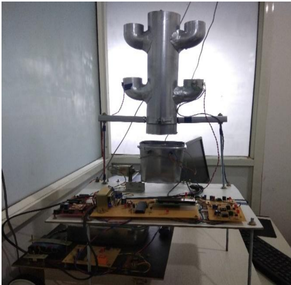
Fig 2: Proposed prototype model

The proposed prototype model of our project is shown in the fig 2 given below,