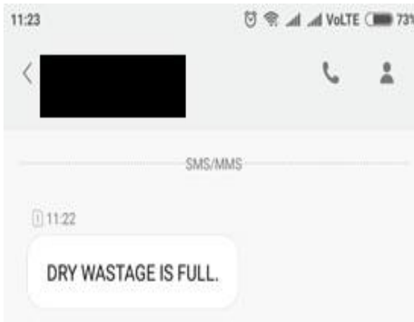
Fig 3: GSM message when the dry bin is full