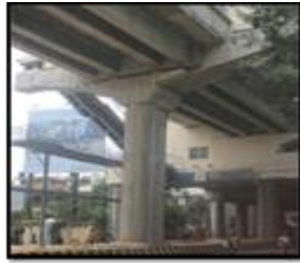
FIGURE 1.2 Typical Pier