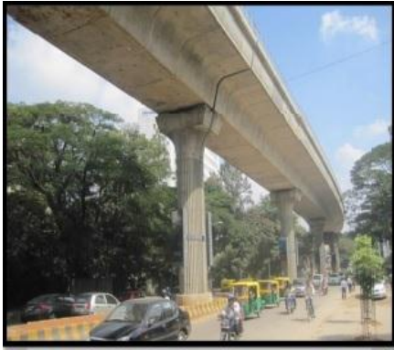
FIGURE 1.1 Typical Elevated Metro Bridge