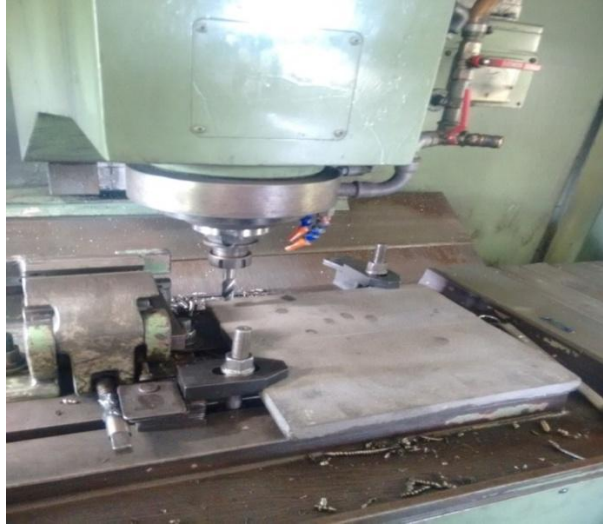
Figure.1 Experimental Setup

Computation of optimal drilling parameters (speed, feed rate and tool material) is based on the Taguchi method to minimize surface roughness. To achieve the computation of optimal cutting parameters, three different speeds (850, 1150 and 1440 RPM) with three different feed rates (90, 120 and 135 mm/min) are used to carry out the tests. The vertical machining centre machine is used to conduct the drilling experiment. The surface roughness is measure using surface roughness tester.