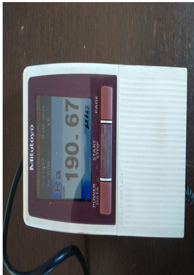
Figure.2 Surface Roughness Tester.

Arithmetical mean deviation from the mean line of profile is the average value of the ordinates ( y_1, y_2, \dots ) from the mean line is Ra (Roughness average) value.