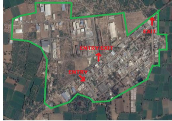
Figure 2. Gozaria GIDC