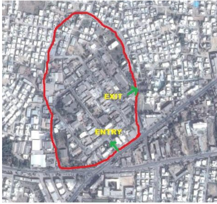
Figure 1 Visnagar GIDC