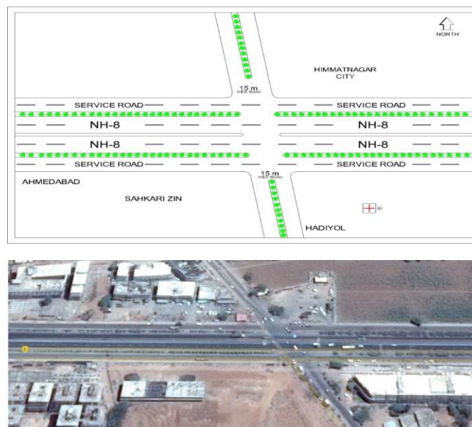
Fig.2 Location of Intersection

At this intersection 20 m wide four lane national highway cross the 15m wide four lane state highway. Heavy traffic flow on NH cross the intersection that is influence to pedestrian, traffic delay on SH.its lead to accident occur.