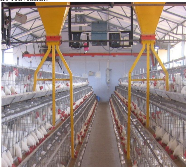
Fig 1: automatic feeding equipment

Layer feeds[7] are designed to provide optimum nutrition for birds laying eggs for consumption. This automatic feeding system works similar to electric overhead traveling (eot) crane. layer breeding of chickens is carried as shown by using this mechanism feeding becomes convenient.