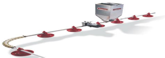
Fig3: broiler feeding equipment

Broilers are type of chickens reared for meat. To feed these chickens in large scale poultries big automated feeders are used as shown below.